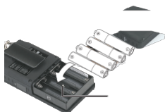
Battery Type Selector

WARNING: Never install alkaline batteries with the Battery Type Selector switch set to NI-MH. Alkaline batteries can get hot or explode if you try to recharge them.