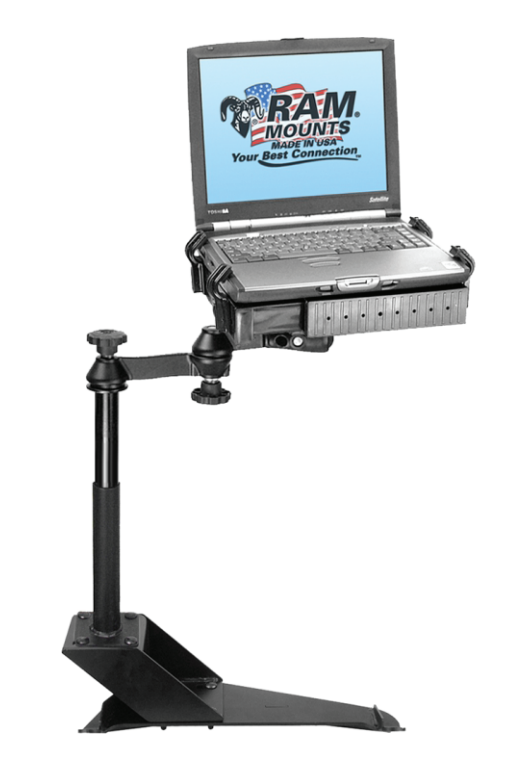
Product Number: RAM-VB-138-SW1

The RAM-VB-138 will not fit BENCH SEAT MODEL TRUCKS