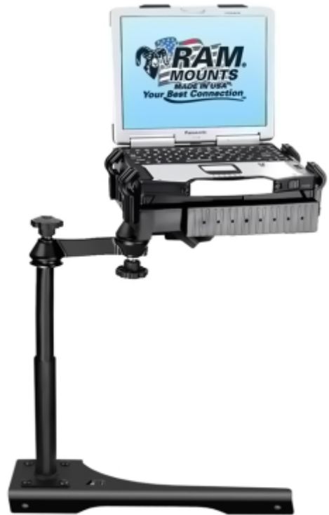
Complete Vehicle Mount RAM-VB-186-SW1

Installs in minutes with no drilling required Low profile keeps mount away from passenger leg space Lifetime warranty