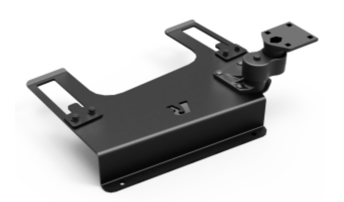
Vehicle Base RAM-VB-193