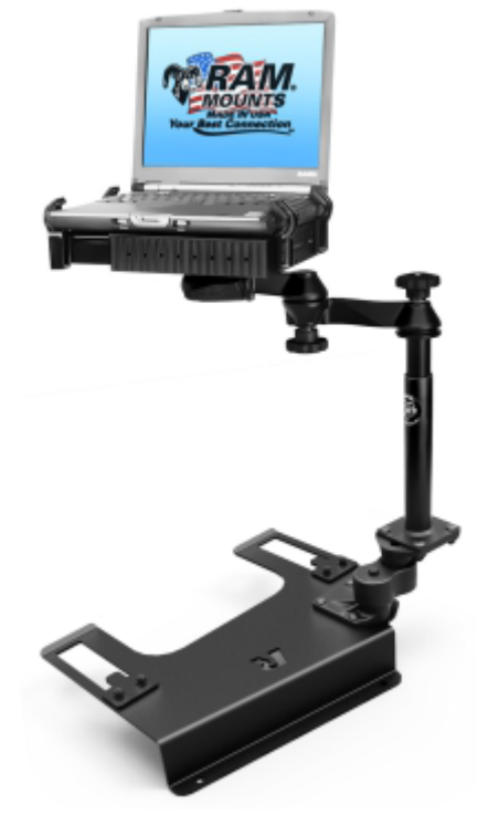
Complete Vehicle Mount RAM-VB-193-SW1