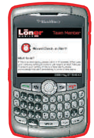
LonerMobile safety application for BlackBerry screenshots