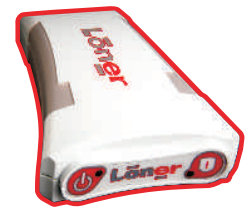
LonerGPS dedicated safety device